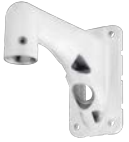
WV-QWL501S-W Wall Mount Bracket