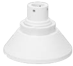
WV-QSR506S-W Mount Bracket